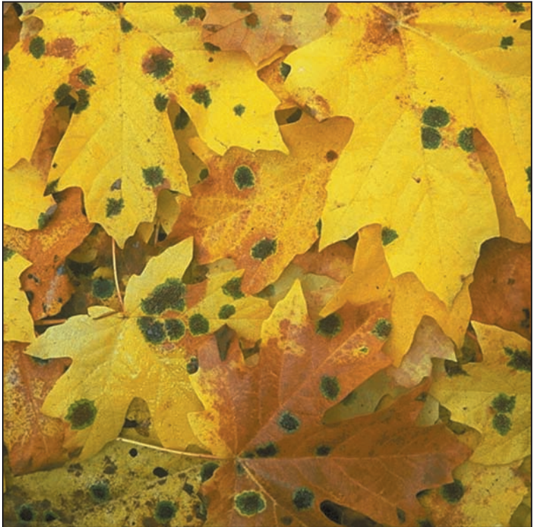
Mold growing on fallen leaves.

This document is available on the Environmental Protection Agency, Indoor Environments Division website at: www.epa.gov/mold